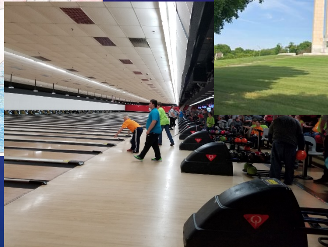
Special Olympics State Team Bowling