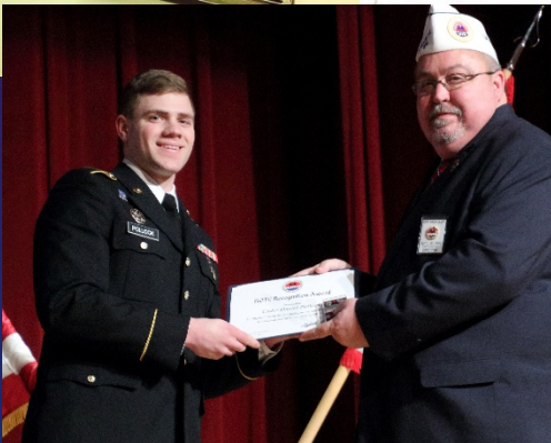
ROTC and JROTC