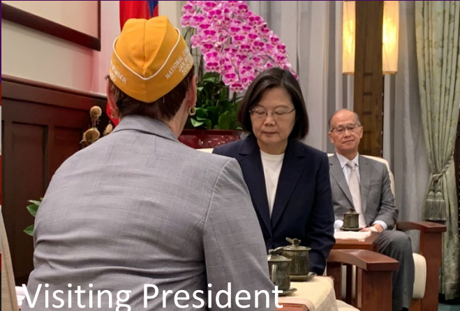
Visiting President Tsai of Taiwan